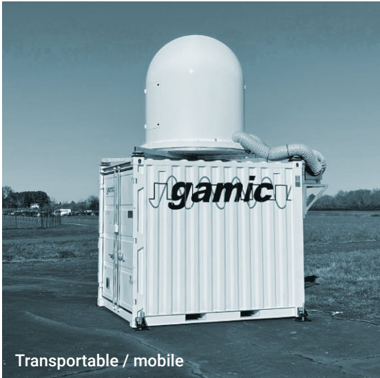
Transportable / mobile